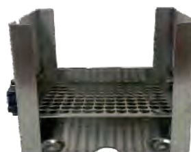
Multi Micro-Plate holder