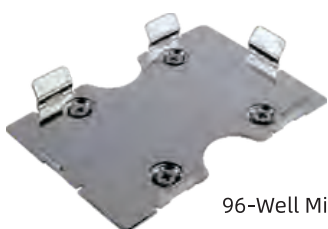
96-Well Micro-Plate Holder