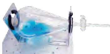
Separate Funnel Fixture