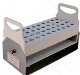
Adjustable Tube Racks