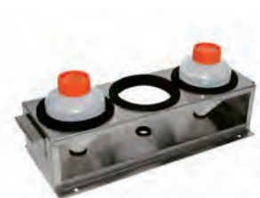
Bioreactor Tube Holder