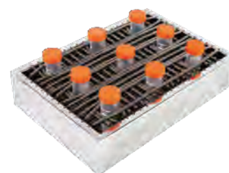
Mini Universal Spring Platform