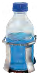
Infusion Bottle Clamp