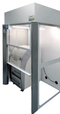
AWIH 1502 floor type (floor standing type)