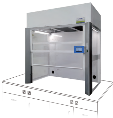
AIH 1502 desktop